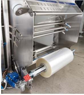
Motorized film unwind with pneumatic reel locking system