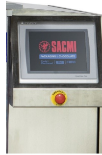
Sloped roof control cabinet with 10.7" HMI color touch screen